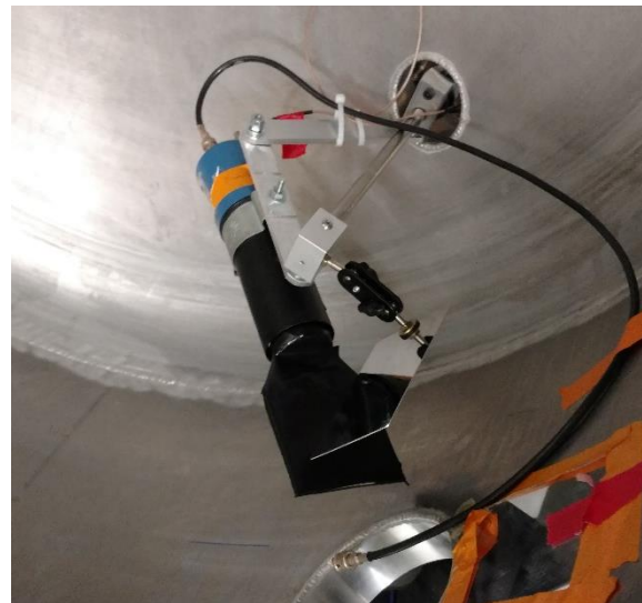
Mirror in place, lifted up. (don't put to this position unless you are Sean or Jon)

When switching between DSS and mirror, do not lift above dowels.