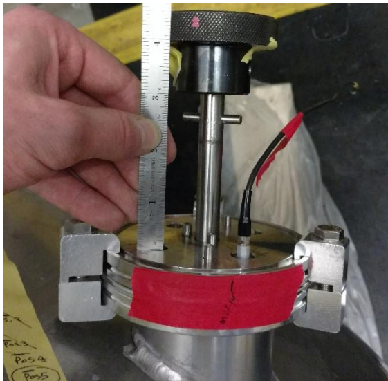
DSS, lifted out of beam path