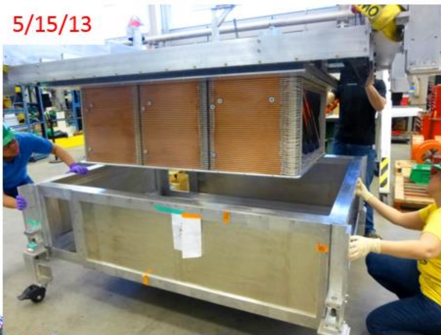
Installation of Field Cage